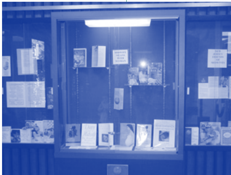
One example of the library display case set up by Karen Wallace.

Citizens for Midwifery Copyright October 2003